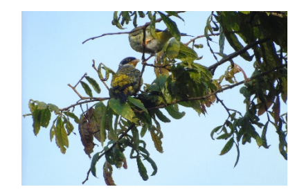
Photo description: Palkachupa in Teoponte Project reference: 24/011 Location: Teoponte, La Paz, Bolivia <u>PHOTO LINK</u>

How lovely to be able to contribute to the conservation of our heritage by drinking good coffee produced by Bolivian communities committed to the environment and biodiversity!